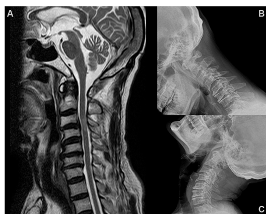
Figure 1 (A) Static MRI—sagittal T2 image showing no significant compression. Cord signal changes noted at C3–4 junction. (B and C) Flexion and extension X-ray films with C3–4 listhesis.