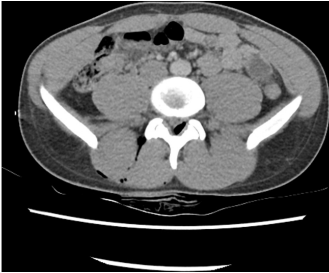
Figure 2 CT image in the transverse plane illustrating air in the spinal canal.

inserted, and on day 11, he underwent lumbosacral stab wound exploration and washout. The wound was extended laterally, washed out with saline/peroxide and then closed with watertight opposition of the fascia and closure of superficial structures. The lumbar drain was removed after 8 days, and he was discharged.