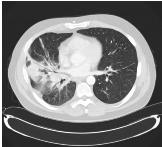
Figure 2 Axial slice of contrast-enhanced CT chest showing middle and right lower lobe consolidation.

The diagnosis of TFB in children appears to be delayed for more than 1 week in a small but significant proportion of children. 1,2 However, a case in which the onset of symptoms occurs so long after initial aspiration is unheard of in the literature. In our case, the chronic cough and persistent right lower zone consolidation raised concerns about a proximal obstructing mass; most likely a bronchogenic carcinoma with our patient’s history of smoking. Yet this obstruction had not caused any symptoms until the preceding year. This may be because aspiration occurred at such a young age that the patient’s airway was able to remodel and adapt to the presence of this foreign body. For example, during childhood it may have been absorbed into the mucosal lining of the bronchus which developed around it. Subsequently, the cumulative effect of smoking and infection later in adulthood, led to right middle and lower lobe obstruction that presented as persistent consolidation. Therefore, any obstructive pathology caused by the cone may only have presented over a relatively short period, prior to which it