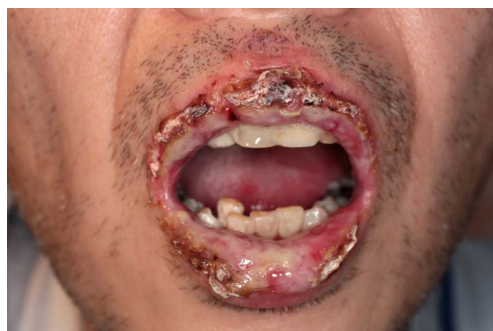
Figure 1 Crusted erosions on the lips.

Provenance and peer review Not commissioned; externally peer reviewed.