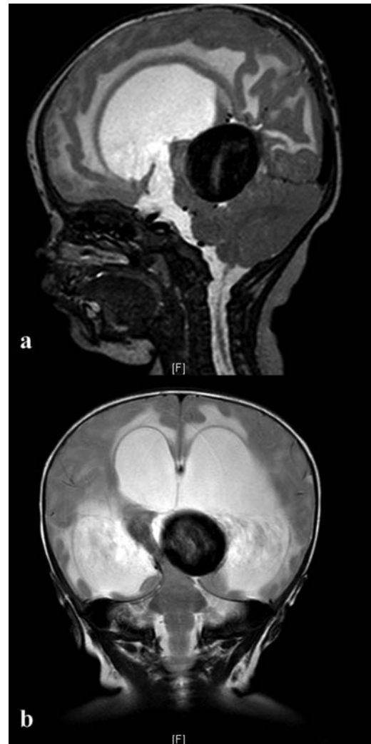
Figure 1 (A and B): Mid-sagittal and coronal T2-weighted images showing a large flow void in midline posterior to the third ventricle region causing mass effect on aqueduct and moderate-to-severe hydrocephalus.

embolisation techniques by puncture of the sinus confluence and setting catheter to the aneurysm or by catheterisation of the femoral vein. 5