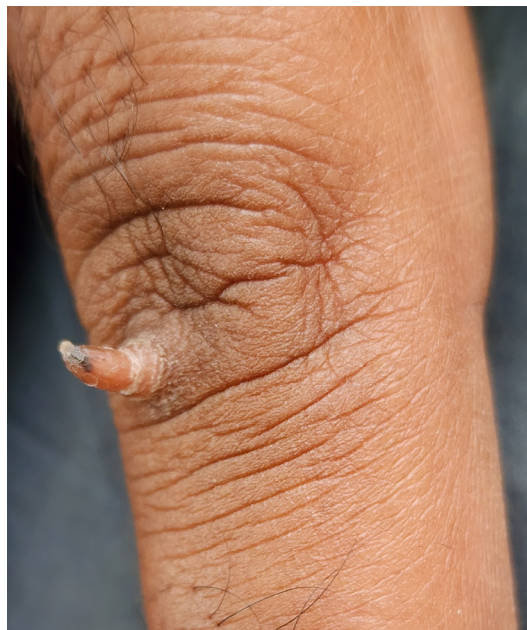
Figure 1 Horn-like growth arising from the dorsal surface of the left index finger with hyperkeratotic collarette at its base.

be seen on the lower lip, nose, elbow, prepatellar area and periungual tissue. The size of the lesion is generally less than 1 cm, but there are reported cases of ADFK of more than 1 cm. These lesions are designated as GADFKs as in the index. 2