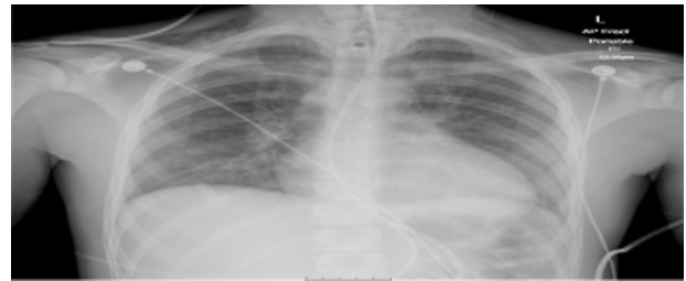
Figure 2 Chest X-ray showing subcutaneous emphysema at the base of the neck and supraclavicular regions bilaterally.

Chest X-ray confirmed subcutaneous emphysema in the neck and supraclavicular regions (figure 2). CT chest postsurgery showed extensive subcutaneous and mediastinal emphysema