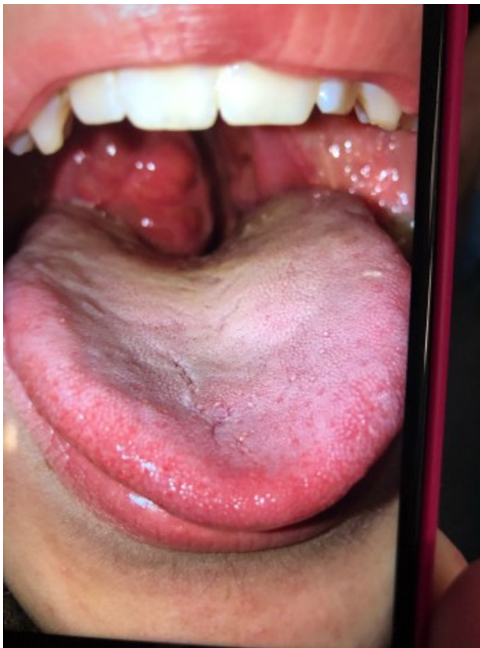
Figure 1 Right tonsillar mass covering more than 75% of the oropharyngeal inlet with only a slit available for passage of air.

trachea and vocal cords by the ENT surgeon. The patient was then transferred to Intensive therapy unit (ITU) and ventilated postoperatively for 2 days. He developed surgical emphysema and negative pressure pulmonary oedema postoperatively.