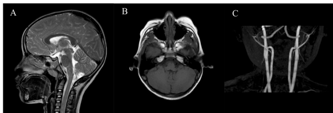
Figure 2 Brain magnetic resonance angiography showed no abnormal findings. (A) T2-weighted sagittal image showing no Chiari malformations. (B) T1-weighted axial image showing no neoplastic lesions in the posterior cranial fossa. (C) No abnormalities in the carotid or vertebrobasilar arteries were observed.

PCH cases where the patient had obvious internal jugular vein valve dysfunction have been reported. 8,9 According to these reports, if there is internal jugular vein valve dysfunction, then coughing and Valsalva manoeuvres (among other symptoms) raise intrathoracic and intra-abdominal pressure, causing transient backflow of venous blood. Subsequently,