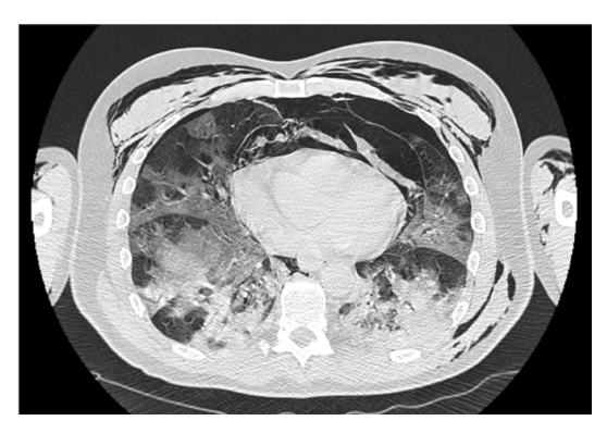
Figure 1 Initial chest CT showing subcutaneous emphysema, pneumomediastinum, pneumopericardium and pneumothorax.

Pneumothorax has been reported as a complication occurring during the course of COVID-19 pneumonia in about 1% of hospital admissions and 2% of ICU admissions.1 Likewise, cases of