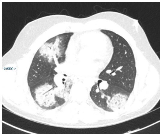
Figure 1 CT scan at admission showing multifocal bilateral consolidation.

On initial presentation, the patient was diagnosed with gastroenteritis due to predominant symptoms of diarrhoea and abdominal pain. Renal colic or pyelonephritis was later suspected due to the severity of abdominal pain with only mildly raised CRP.