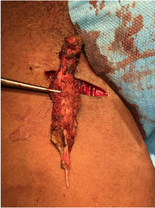
Figure 2 Peroperative photo of resected ossified mass of the right adductor longus muscle.

collection located proximally. Distally, a calcification of 8 cm was seen, indicating a chronic disease process with signs of active inflammation.