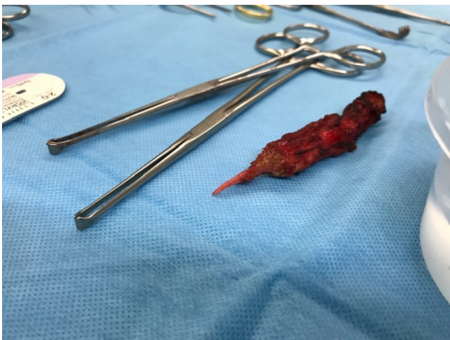
Figure 3 Resected ossification along surgical instruments.

The differential diagnosis of MOT includes benign and malignant diseases. Benign diseases that may be confused with MOT