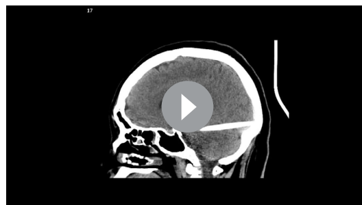
Video 1 CT and 3D-CT shows the foreign body clearly

After the incident, the patient had no remarkable changes physically and psychiatrically except for the loss of vision in her left eye due to the orbital apex syndrome. The neurosurgeons decided not to remove the tip because its location was in an area with a high risk for critical complications. The left eye lost all light perception, and the patient developed ptosis, total motility indicating a disruption of the oculomotor nerve, dilatation of the pupil and hypotropia. The optic