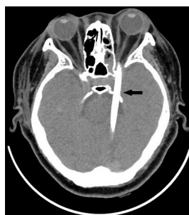
Figure 1 CT scan shows an intracranial rod-shaped foreign body. Intracerebral haemorrhage is not present (arrow).

To cite: Shimizu N, Baba T, Watanabe Y, et al. BMJ Case Rep 2020; 13 :e239721. doi:10.1136/bcr-2020-239721