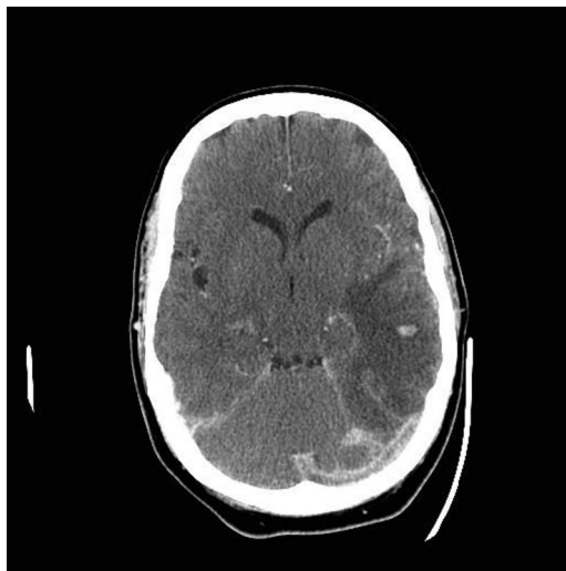
Figure 1 Contrast-enhanced CT of the head showed a large thrombus within the confluence of sinuses, extending into the left transverse and sigmoid sinuses, and a large left-sided venous infarct with haemorrhagic foci involving the left temporal and parietal lobes.

This has significant consequences in terms of both morbidity and mortality. CVST has previously been associated with poor outcomes and mortality of 30–50%. 2 The lower mortality observed in recent studies, such as the International Study on Cerebral Vein and Dural Sinus Thrombosis (8–14%