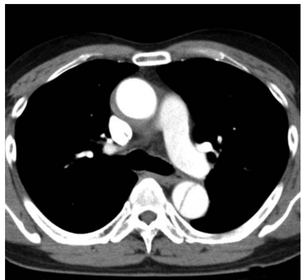
Figure 1 Contrast-enhanced CT illustrates the development of retrograde type A aortic dissection with patent false lumen in descending aorta.

A 59-year-old man developed sudden onset of chest pain and was admitted to our hospital. Emergent contrast-enhanced CT showed the development of retrograde-type A aortic dissection (AD) with patent false lumen in the descending aorta and thrombosed false lumen in the ascending aorta (figure 1). The patient was treated with intensive drug therapy. We evaluated blood pressure (BP) variability by ambulatory BP monitoring (ABPM), which revealed that the mean BP over 24 h was 150/75 mm Hg with a typical morning surge (figure 2B) despite a combination of several antihypertensive medications for previous 1 month such as amlodipine besilate 10 mg, telmisartan 80 mg, bisoprolol fumarate 5 mg, doxazosin mesilate 8 mg, eplerenone 50 mg, trichlormethiazide 2 mg and methyldopa 50 mg/day. Obstructive sleep apnoea (OSA) has been reported as a cause of drug-resistant hypertension, 1 so we performed sleep polygraphic study. This revealed severe OSA with an apnoea-hypopnea index of 56.7/h and lowest percutaneous oxygen saturation of 84% (figure 2A). We started continuous positive airway pressure (CPAP) for the treatment of OSA. Two weeks after the introduction of CPAP, follow-up ABPM revealed a marked decrease in mean systolic and diastolic BP to 126/66 mm Hg (figure 2C). History of hypertension is the most common predisposing factor for AD. 2 The presence of OSA is associated with increased risk of incident hypertension, and treatment with CPAP therapy reduces this