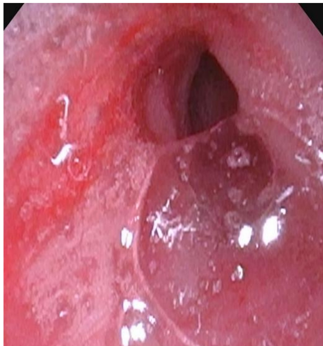
Figure 2 Bronchoscope performed on discharge.

was weaned from VV-ECMO on day 3 following evidence of improvement on chest X-rays. On day 10, the tracheal tube was moved proximally from the stenosis, but tidal volume could not be maintained because the distal end of the tube contacted the stenosis. The tube was reinserted and mechanical ventilation was continued. Tracheostomy was performed on day 28, removal of the tracheal tube was performed on day 41, and the patient resumed oral feeding (figure 2). He was discharged on day 45.