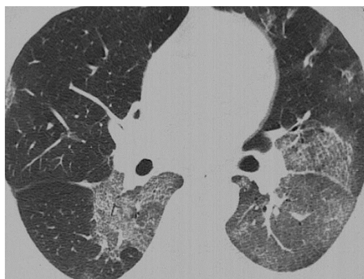
Figure 1 Chest CT on admission shows diffuse areas of ground-glass opacity.

Though precise incidence of drug-induced lung injuries has not been accurately determined, recently the report of drug-induced lung injuries in Japan has increased since 2000. 1 DAD has the tendency to lower response to therapy and poor prognosis. 2 It has been reported that many kinds of drugs can cause drug-induced lung injuries; however, some types of drugs such as cytotoxic agents and molecular targeting drugs may lead to trigger DAD. 3 In addition, as for diffuse alveolar haemorrhage, it has been also reported that various types of medications can cause diffuse alveolar haemorrhage, such as propylthiouracil, chemotherapy agents, anticoagulants and thrombolytic agents. Generally speaking, drug-induced DAD, which is caused by cytotoxic mechanisms, may not respond to corticosteroids 2 ; however, the patient responded to corticosteroids dramatically and chest radiograph returned to normal on fourth hospital visit. topikku GX is mainly composed of eight types of ingredients and additives. There have been reports of lung injuries derived from ingredients of which topikku GX is composed. These ingredients are acetaminophen, chlorpheniramine, ephedrine niu-huang and dihuang. Most of the pathogenetic mechanisms by which drugs induce lung injuries are unknown. To the best of our knowledge, none has reported that 'over-the-counter drug' induced lung injuries exhibiting both diffuse alveolar haemorrhage and DAD (table 1). We should