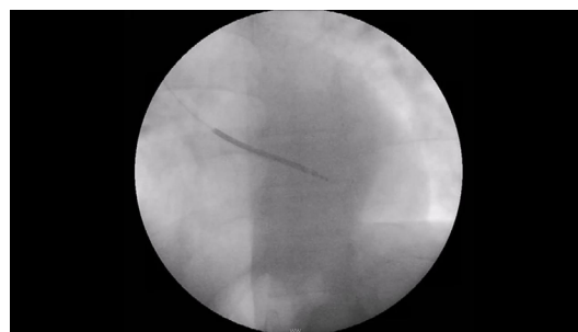
Video 1 Pullback of implantable cardioverter defibrillator (ICD) lead during screening demonstrates passage of the lead to the systemic circulation via an atrial septal defect.

A 61-year-old man presented with recurrent presyncope, 12-lead ECG and echocardiographic features of a right ventricular (RV) cardiomyopathy, and non-sustained ventricular tachycardia on Holter monitoring. During defibrillator implant for presumed arrhythmogenic RV cardiomyopathy, ventricular pacing parameters were satisfactory and the following images were obtained (figure 1). The implantable cardioverter defibrillator lead appeared well sited in the RV apex on posterior-anterior fluoroscopy (figure 1A). However, screening in the left anterior oblique (LAO) projection raised doubts about the true lead position (figure 1B). On-table echocardiography and 12-lead ECG confirmed lead placement within the left ventricle (LV). Pullback of the lead, while screening, suggested passage to the systemic circulation via an atrial septal defect (ASD; figure 2A–D and video 1). Attempts to reposition the lead by advancing it from the superior vena cava (SVC) revealed an anomalous connection to a right pulmonary vein (figure 2E). The lead was eventually placed within the RV apex (figure 2F,G). Prior MRI imaging commented on the suspicion of