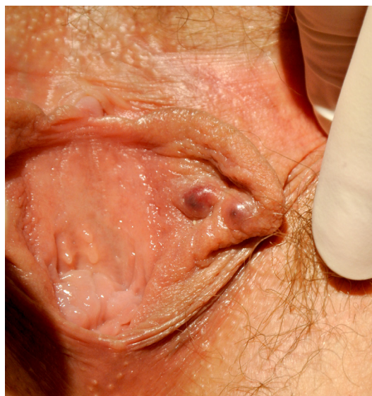
Figure 1 Clinical: two smooth bluish cysts on the inner aspect of the left labium minorum.

An antiandrogenic contraceptive pill/oral contraceptives (cyproterone acetate 2000 µg,