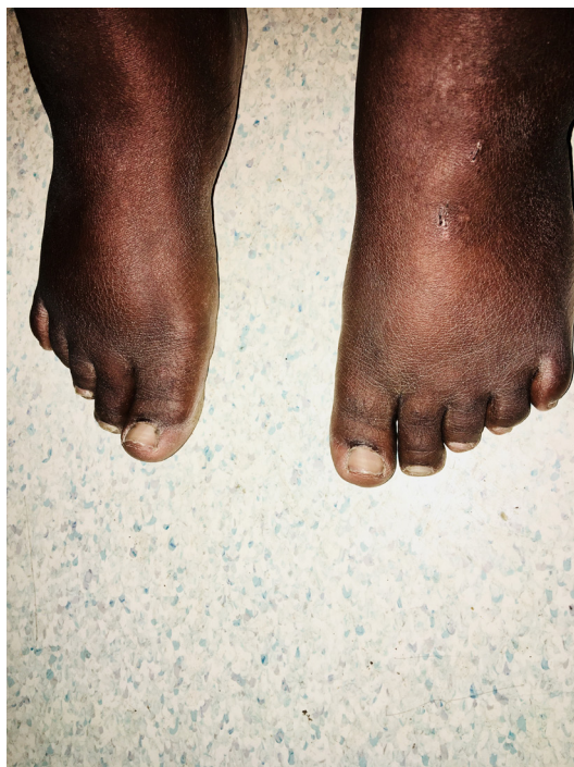
Figure 1 Brachydactyly of the feet.