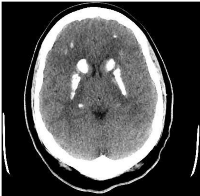
Figure 6 CT of brain showing extensive basal ganglia calcifications.

resistance. When PHP is present with clinical features consistent with Albright's hereditary osteodystrophy such as round facies, obesity, short stature, brachydactyly and intellectual deficiencies, the patient is classified as PHP1a. These patients