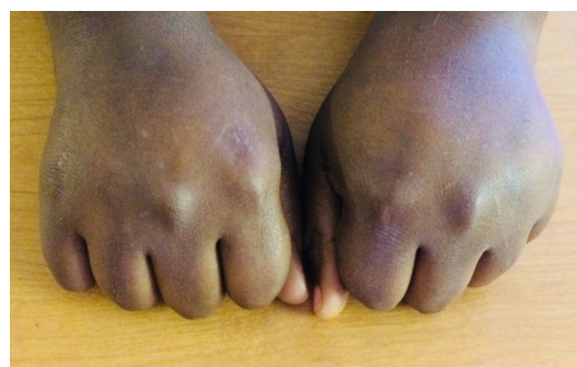
Figure 3 Archibald's sign (absence of the fourth and fifth knuckles on clenched fists).