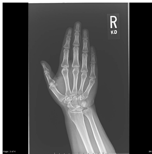
Figure 4 X-ray of hand showing shortening of fourth and fifth metatarsals.

oral calcium and calcitriol with improvement of her serum calcium and symptoms.