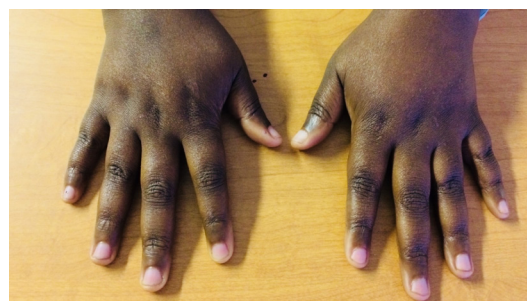
Figure 2 Brachydactyly of the fourth and fifth digits.

Her lab tests were remarkable for calcium of 5.7 mg/dL (8.6–10), phosphorus of 5.3 mg/dL (2.7–4.5) and magnesium of 1.5 mg/dL (1.5–2.6). 25-hydroxy vitamin D was 28 ng/mL (30–100), blood urea nitrogen was 11 mg/dL (6–20) and creatinine was 0.88 mg/dL (0.5–0.9). Thyroid Stimulating Hormone (TSH) was 3.73 U/mL (0.3–4). Parathyroid hormone (PTH) was markedly elevated at 192 pg/mL (14–64) and the diagnosis of pseudohypoparathyroidism (PHP) was made. She was started on intravenous and