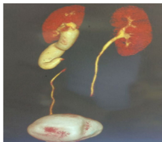
Figure 2 Reconstruction image of the same patient showing proximal hydroureteronephrosis and classical S-shaped loop of the ureter behind the inferior vena cava.

Retrocaval ureter is also known as circumcaval ureter. It is a term used to describe an abnormal