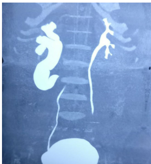
Figure 1 CT urography of 33-year-old woman showing right retrocaval ureter.

Most patients are asymptomatic with most common presenting feature being flank pain and/or recurrent urinary tract infections due to urinary stasis.