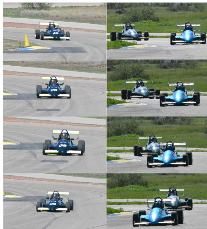
Figure 1 Driver's head position in sequential images taken on entry, mid-corner and corner exit without the halo-type structure (left-hand sequence) and with the halo-type structure (right-hand sequence). An increase in right lateral flexion can be seen particularly on corner entry and corner exit.

Separate mixed-effects growth models were used to compare normalised median frequency (NMF) of each muscle across the two simulations. A progressive modelling strategy was used. 12 This strategy involves testing a series of models and determining which model fits the data better based on the results of a X^2 likelihood ratio test. This strategy is recommended when using growth models to examine rates of change over time. 13 First, an unconditional linear growth model was fitted to the data to examine whether NMF varied with time across the 10 laps. If the linear model growth suggested that NMF was time dependent, a quadratic trend was added to the model to examine whether the rate of change NMF accelerated or decelerated. If the quadratic trend suggested that the rate of change was not constant, a cubic trend was added to the model to examine whether the influence of quadratic trend diminished or increased over time. Conditional models were