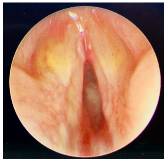
Figure 2 Obstructive tissue can be visualised beyond the vocal cords.

Otolaryngology was unable to insert a rigid 2.5 mm bronchoscope into the trachea though a 1.9 mm bronchoscope was able to be passed. Complete tracheal rings were seen immediately distal to the vocal cords down to carina (figure 3). The surgeon was also unable to intubate the patient with a 2.0 endotracheal tube. Tracheostomy was not an option due to complete tracheal rings throughout the entire length of the trachea; therefore, the airway was temporised with a laryngeal