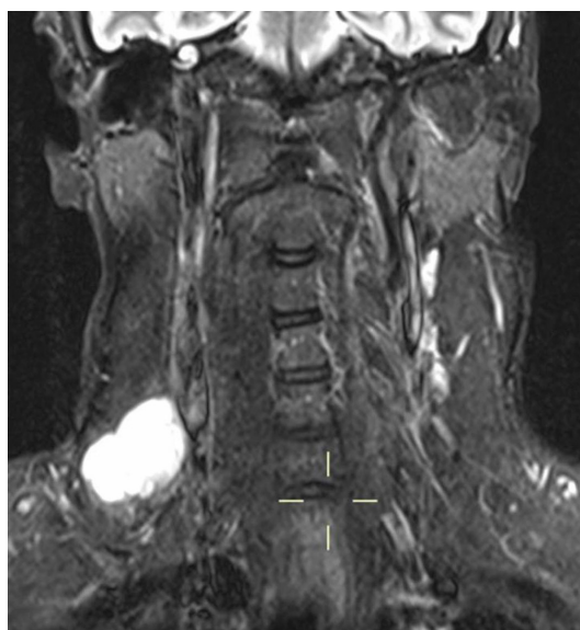
Figure 1 T2 fat-saturated MRI study of the neck that demonstrates persistence of the right-sided cystic lesion despite injection sclerotherapy. There is subtle low signal at the base of the lesion, which was initially thought to be debris. In retrospect, this is likely to reflect mural nodularity of one of the cysts.

A cystic lateral neck mass can be a diagnostic challenge for radiologists and ear, nose and throat surgeons. Differential diagnoses include a metastatic node, branchial cleft cyst, lymphovascular malformation, necrotic node post-suppurative lymphadenitis and cystic neurogenic tumour. In adults, cystic metastatic nodes from head and neck cancer are well recognised, especially from squamous cell carcinoma and papillary carcinoma. The presence of a thickened wall and/or mural nodularity in a cystic mass should raise the possibility of malignancy, although this cannot be relied on, as metastatic nodes can be thin walled and completely cystic. 1 Therefore, any cystic neck mass in the lateral neck in an adult should undergo US-guided FNAC for confirmation. Unfortunately in this case, the FNAC was inconclusive. That there were multiple cystic nodes was not appreciated before surgery as the nodes were abutting one another, simulating a multiloculated cystic lesion.