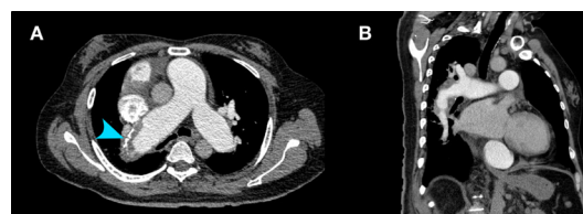
Figure 2 Chest tomography angiography, axial view (A) and sagittal view (B), showing pulmonary artery dilatation and calcified eccentric thrombus (arrowhead) in the right pulmonary artery, consistent with chronic thromboembolic pulmonary hypertension.

A diagnosis of Klippel-Trenaunay-Weber syndrome (KTWS) was made. It is characterised by congenital vascular malformations, varicose veins and a localised disturbed growth of the bone and/or soft tissues, resulting in