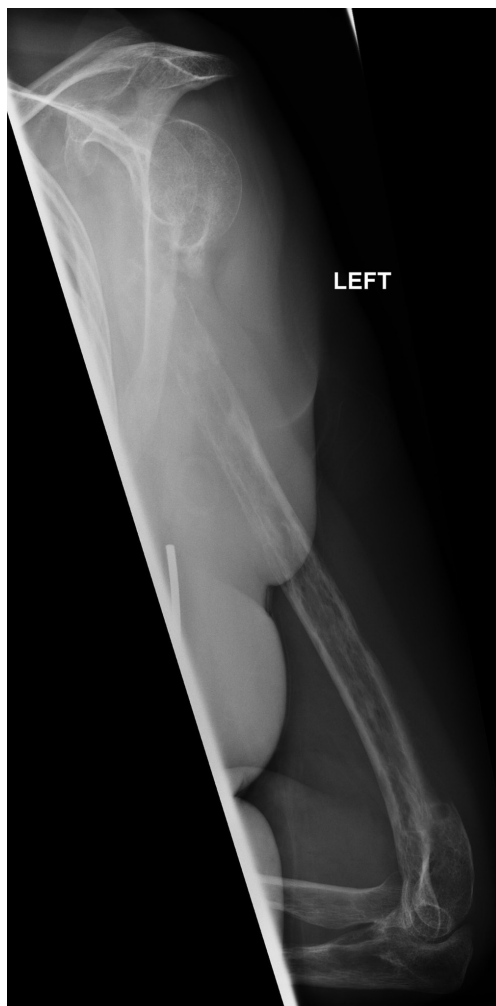
Figure 4 Radiograph of left humerus and elbow 15 months after presentation. Rapidly progressing and multifocal Gorham-Stout disease.

reported in the literature, 8 of which have involved the humerus. While the condition is considered benign, the prognosis is uncertain, with potential fatal complications that include disease spread to the vertebrae, leading to pleural effusion and quadriplegia. The progressive bone loss can lead to complete bone resorption. Associations have been proposed between massive