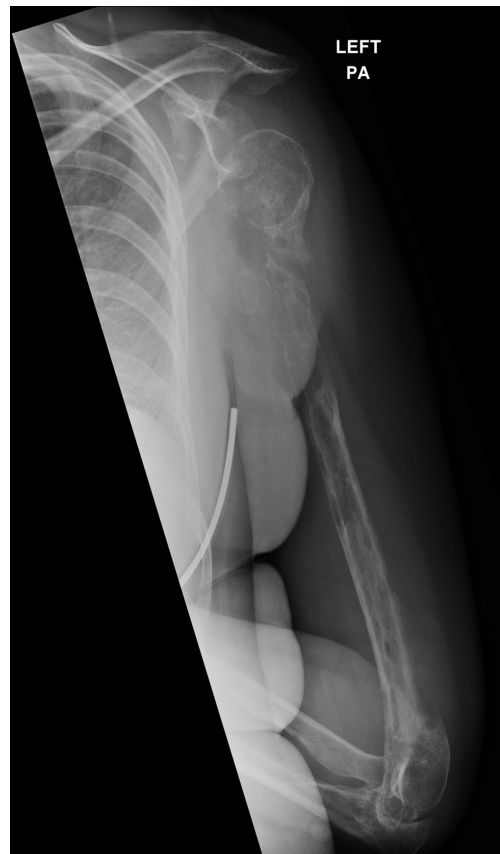
Figure 5 Radiograph of left humerus 18 months after presentation. PA, posterioranterior.

osteolysis following trauma or as a result of increased osteoclast and interleukin 6 activity. In spite of this, the definitive aetiology and pathology of the disease remain unknown. Due to its rarity, diagnosis is challenging and first requires the exclusion of more common disorders including neoplastic, inflammatory, infectious and endocrine disease. Presentation can include pain, functional impairment and swelling, although asymptomatic cases have been described. X-ray may show atrophy, bone tapering and pathological fractures. The gold standard for diagnosis is a biopsy demonstrating angiomatous tissue. 2 This is an integral component of the diagnostic criteria for GSD proposed by Heffez et al 3 :