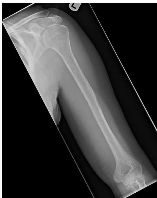
Figure 1 Radiograph of left humerus and shoulder at presentation.

Twelve months after presentation, with continued pain and swelling in the arm, further investigations were carried out. Radiographs demonstrated a second pathological fracture of the left proximal humerus, with intramedullary and subcortical radiolucent foci ( figure 2 ). Contrast MRI scans and angiogram showed a more extensive vascular lesion than previously seen with no sign of arteriovenous malformation. Bone biopsy showed a highly vascular lesion with lymphovascular exudate and no obvious solid lesional tissue. Bone and soft tissue samples showed prominent osteoclastic bone resorption ( figure 3 ). CT chest, abdomen and pelvis revealed no sign of malignancy. At that point, bone