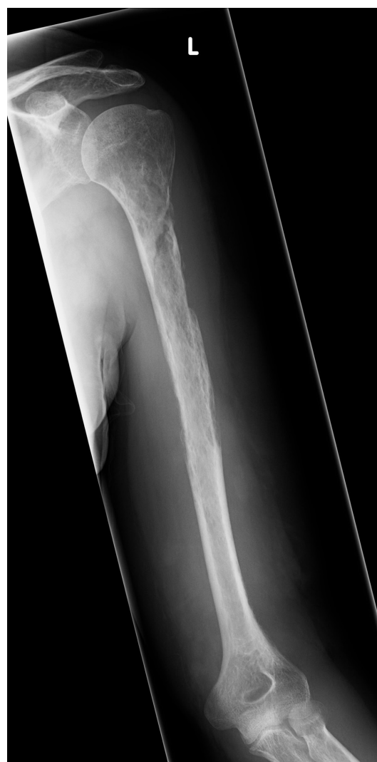
Figure 2 Radiograph of left humerus 12 months after initial presentation.

scan demonstrated isolated humerus involvement. However, subsequent radiographs taken 1 month later revealed rapidly spreading disease, with near-complete resorption of the humerus, and suspicion of disease spread to the ulnar ( figure 4 ). At this point, with the histological and radiological findings, a diagnosis of Gorham-Stout disease (GSD) was considered, with a second opinion sought from the multidisciplinary team in Birmingham. A consensus diagnosis of rapid and multifocal GSD was made. The most recent X-ray is seen in figure 5 .