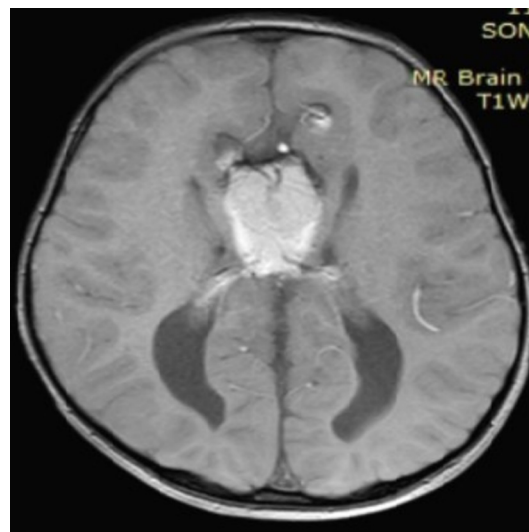
Figure 4 MRI brain (T1W image): hyperintense lesion with extensions in bilateral lateral ventricles and anterior subarachnoid spaces. Agenesis of corpus callosum present.