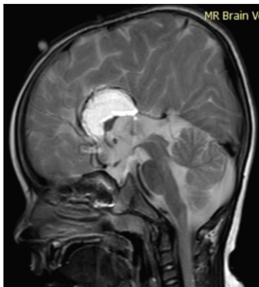
Figure 2 MRI brain (T2 image): well-defined hyperintense mass lesion situated in the midline just superior to the high riding third ventricle with non-visualisation of the corpus callosum.