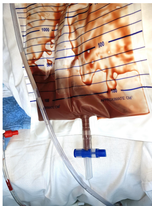
Figure 2 'Chocolate-like' liquid coming from the percutaneous drainage of the liver abscess.