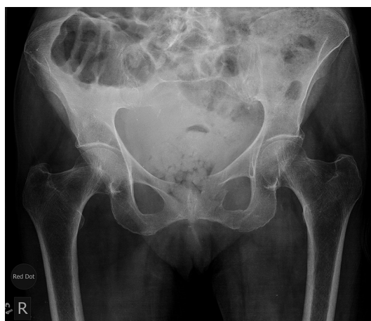
Figure 1 X-ray pelvis showing the fractures of superior and inferior pubic rami on the left.