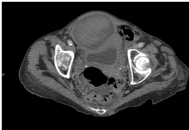
Figure 4 Cross-sectional image over pelvis showing the anteriorly situated hypointense collection (haematoma) compressing bladder posteriorly.

facts. She being on aspirin despite normal platelets, the prophylactic enoxheparin given to prevent deep vein thrombosis and the fact that geriatric patients have lost their ability to mount an effective tamponade effect due to loss of vasospasm and tissue elasticity. 1