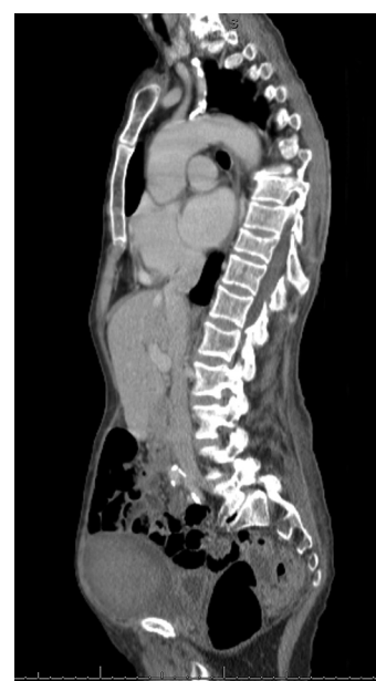
Figure 3 Parasagittal section of the CT showing the well-defined collection situated anterior to the bladder extending to superficial pelvis.