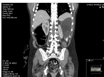
Figure 2 CT scan—coronal plane—dilated rectum with foreign bodies inside.

and altered state of consciousness, culminating in cardiorespiratory arrest in asystolia and subsequently ventricular fibrillation with recovery after advanced life support. The patient was submitted to colonic transversostomy with improvement of the condition.