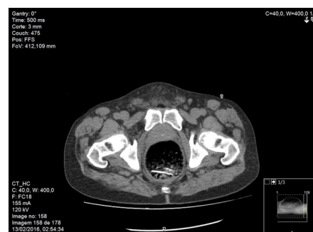
Figure 3 CT scan—transverse plane—dilated rectum with bones/screws inside.

The authors present a clinical case of a 61-year-old man with clinical history of cognitive impairment and pica, admitted in an intensive care unit after cardiorespiratory arrest. The initial hospital admission was for constipation and abdominal pain. Abdominal and pelvic CT scan revealed 'significant colonic dilatation with a sigmoid size of 14.5 cm, with evidence of abundant intraluminal faecal content at this level—aspects suggestive of translating obstructive process by faecaloma, visualising bone and metallic contents inside'. A rectal touch was performed with extraction of abundant faeces and foreign bodies (bones and screws). After abundant excretion, he had bradycardia with haemodynamic instability