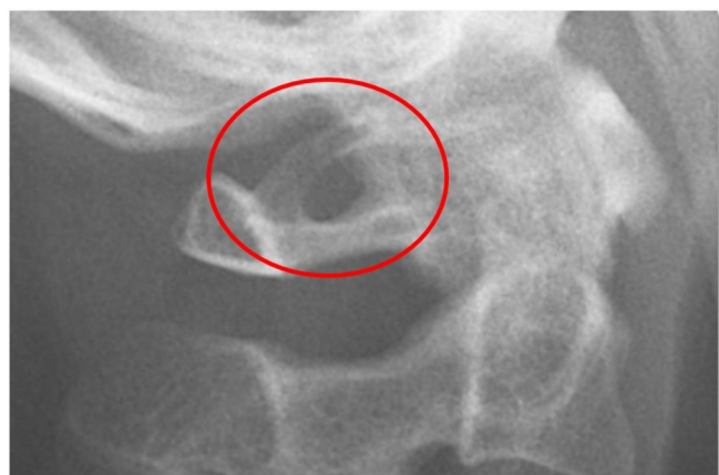
Figure 4 Cropped digital lateral cephalogram of 42-year-old Chinese female patient showing complete ponticulus posticus.

As a differential diagnosis related to the cause of dizziness and headaches in the spine region, it is pertinent to consider anomalous origin of vertebral artery as well although such anomalies are rare. 4 Evidence states that vertebral artery anomalies like kinking, looping and dual origin of vertebral artery attributes to dizziness, migraine headache, occipital headache and cerebrovascular stroke. Hence, if symptomatic, the patient should be referred for screening using advanced imaging modalities like CT angiography and Doppler sonography to rule out the