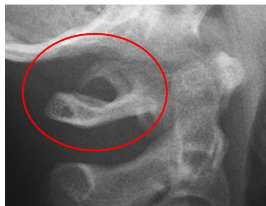
Figure 2 Cropped digital lateral cephalogram of 13-year-old Malay child showing partial ponticulus posticus.