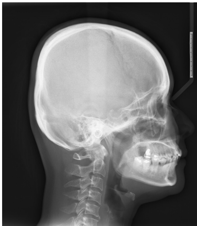
Figure 3 Digital lateral cephalogram of a 42-year-old Chinese female patient.

is diagnosed as complete ponticulus posticus. However, both patients were asymptomatic and did not complain of any headache or related shoulder or neck pain. To understand and identify a patient with ponticulus posticus, a lateral cephalogram of a 35-year-old male patient without any ponticulus posticus anomaly has been shown (figure 5).