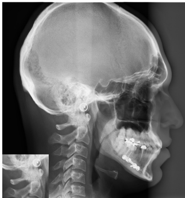
Figure 5 Digital lateral cephalogram of a 35-year-old male patient without ponticulus posticus.

possibility of vertebral artery anomalies. If detected, surgery is the only treatment of choice to improve the circulatory flow and thus aids in relieving headaches. 5