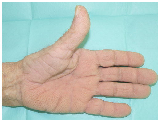
Figure 1 Thickened velvety palms with pronounced folds consistent with acquired pachydermatoglyphia.

Acquired pachydermatoglyphia (also known as tripe palms) is a proliferative paraneoplastic