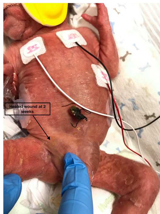
Figure 2 Healed wound at 2 weeks.

pressure on that area against the uterus or maternal pelvic bones or an unknown cause. Both paediatric and plastic surgeons recommended only conservative management. Regular normal saline irrigation, Mepilex transfer, gauze and securement with a maintenance of strict asepsis resulted in healing within the next 10–14 days (figure 2). No local antiseptics were required. The baby received 5 days of systemic antibiotics in view of preterm labour.