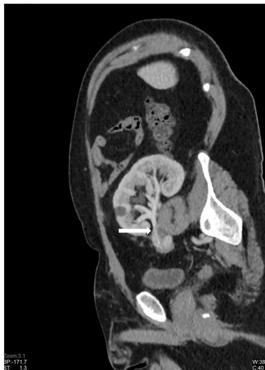
Figure 1 Multiplanar oblique reconstruction of the CT renal angiography confirmed a tight focal stenosis approximately 2.5 cm distal to the anastomosis of the transplant artery to the right external iliac artery (arrow).

Treatment includes conservative medical therapy, percutaneous transluminal angioplasty (PTA) or surgical therapy. In cases with uncontrolled hypertension, deteriorating renal function or worsening stenosis, revascularisation is advised. 1 PTA with stent