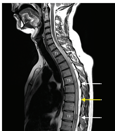
Figure 1 T2 sagittal MRI of cervical and thoracic spine. The white arrows demonstrate the typical appearance of intradural intramedullary spinal metastases with intense surrounding vasogenic oedema noted in the adjacent spinal cord (yellow arrow).

Spinal extradural metastases affect up to 10% of all patients with cancer. 1 Intradural metastases are rare but as systemic therapy improves their incidence has been reported to be on the increase. 2 Lung, brain and breast cancer metastases are among the most common. 2