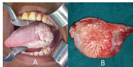
Figure 3 Intraoperative image showing the extent of the lesion (A). Post local excision specimen (B).