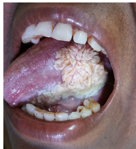
Figure 2 The lesion showing rough, shaggy, papillomatous surface with sharp finger-like surface projections with no surrounding induration.

VC was first delineated as a clinic-pathological entity by Ackerman in 1948. 1 This is a distinct variety, comprising about 2.5%–4% of all squamous cell carcinoma in oral cavity and is relatively uncommon. Its occurrence in tongue is rare. 2 It most commonly occurs after fifth decade, in individuals with adverse habits of tobacco and alcohol. VC has excellent prognosis due to its benign indolent tumour behaviour and metastasis to regional