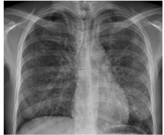
Figure 2 Pneumothorax on chest radiograph.

Pneumocystis infection can present with spontaneous pneumothorax, in 2–6% of cases. 1 It is primarily a disease of the immunocompromised. The aetiology is most likely due to severe necrotising