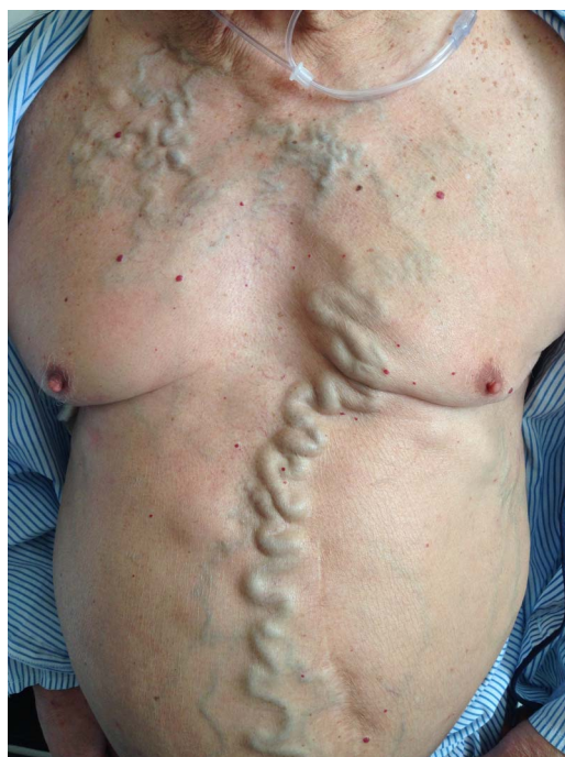
Figure 1 On physical examination, the patient presented with venous collateral circulation, shown as severe distension of the superficial veins in the chest wall.

Persistent left superior vena cava is the most common variation of the thoracic venous system, but it is a rare congenital malformation, with a frequency of ~0.3%. It is considered an embryological remnant in which the left brachiocephalic vein did not fully develop, draining into the right atrium via