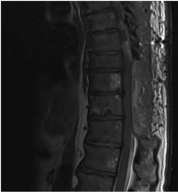
Figure 3 Thoracolumbar spine MRI T2-weighted sequence. Sagittal view demonstrating postoperative resolution of haematoma and cord compression.

concave loculated delineation of isointensity compared with the spinal cord on T1-weighted images, and variable signal hyperintensity on T2-weighted images. 3 This is in contrast to epidural spinal haematomas, which appear broad-based and convex. Prompt neurosurgical evacuation and decompression is essential as prognosis is inversely related to duration of cord compression. 1