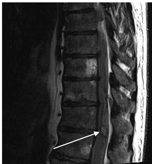
Figure 1 Thoracolumbar spine MRI T2-weighted sequence. Sagittal view showing extensive hyperintense acute intradural haematoma from T7 to T12 (white arrow).

Non-traumatic spinal intradural extramedullary haematomas (SIEH) are extremely rare. The majority require emergency attention as they can rapidly progress to spinal cord compression. In the largest series of 101 cases of spinal subdural haematomas, the thoracolumbar region was most frequently affected, without a gender predominance. 1 Causes of non-traumatic SIEH include iatrogenic (lumbar puncture, spinal anaesthesia/surgery), anticoagulation, haematological disorders, vascular malformations, tumours and an idiopathic aetiology. 2 Only 41 cases due to anticoagulation have been reported in the literature in patients on warfarin or low molecular weight heparin. Typical clinical features are sudden onset back or radicular pain with paraplegia and bowel or bladder paralysis. Meningism and headache may be the initial symptoms with predominantly subarachnoid bleeding. MRI is the gold standard for diagnosis of spinal haematomas. The classical finding in intradural haematomas is a