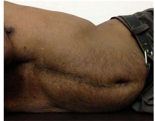
Figure 2 Disappearance of swelling on lying in the right lateral decubitus position.

fascial defect. Subsequent electrophysiology revealed fibrillation potential, and prolonged and high amplitude motor unit action potentials suggestive of truncal polyradicular neuropathy, along with features of axonal sensorimotor polyneuropathy involving all four limbs (figure 3). With exclusion of any obvious cause of the abdominal swelling and features of advanced microangiopathic complications in the background of long-standing uncontrolled type 2 diabetes, a diagnosis of diabetic truncal radiculoneuropathy with abdominal pseudohernia was made. The patient was prescribed a basal-bolus insulin regime for achieving glycaemic control along with pregabalin and amitriptyline for pain relief.