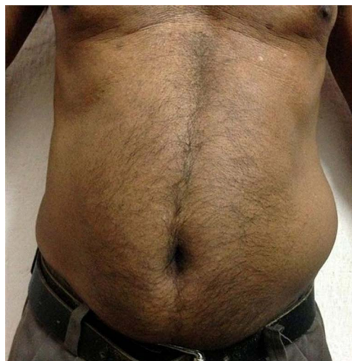
Figure 1 Unilateral swelling on the left side of the abdomen in the upright posture.