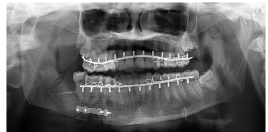
Figure 2 Postoperative orthopantomogram.

Histology confirmed condylar hyperplasia: active endochondral ossification with normal haematopoiesis and adipose marrow. At writing, 12 months