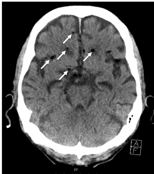
Figure 1 Axial non-contrast CT showing multiple low-density (minus 42 Hounsfield units) abnormalities (arrowed) in the frontal and temporal lobes, and in the parasellar region.

Intracranial dermoid cysts are slow-growing tumours that account for <0.5% of all primary