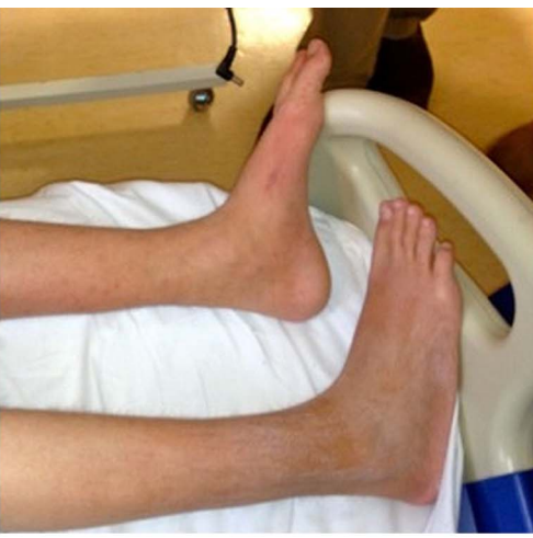
48hours after treatment with Caspofungin