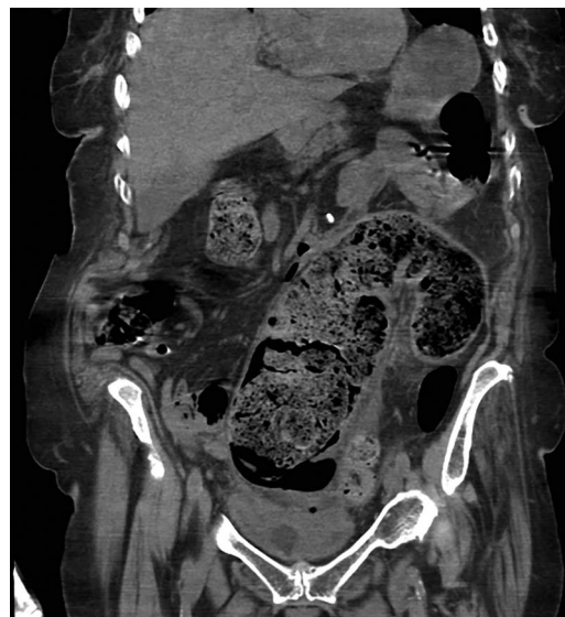
Figure 2 Faecal impaction extending proximally towards the descending colon. Extensive oedematous bowel wall due to compression from the faecaloma.

CT of the abdomen and pelvis showed marked rectosigmoid faecal impaction, compression of the urinary bladder (figure 1) and inflammatory changes in the wall of the rectum and lower sigmoid, consistent with a diagnosis of stercoral colitis (figures 2 and 3). The patient was treated with enemas and intravenous antibiotics; despite this, she continued to deteriorate and, given the high operative risk, was deemed unsuitable for surgery and subsequently died.