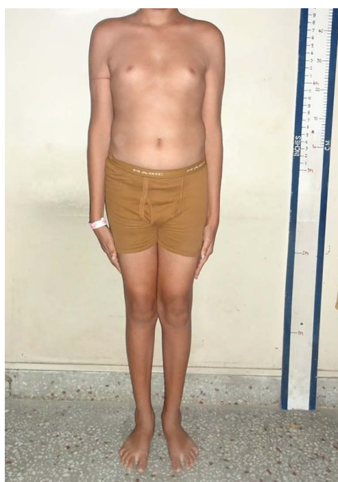
Figure 2 Picture of the patient showing a tall eunuchoid appearance without other skeletal abnormalities.