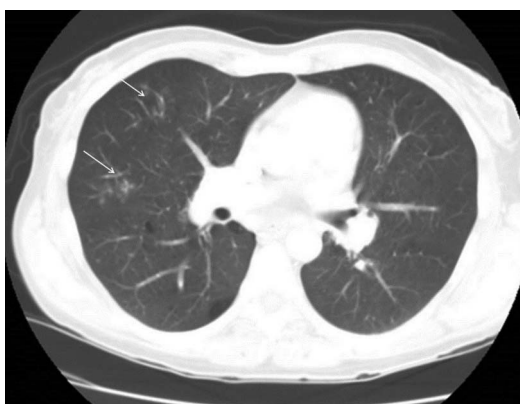
Figure 2 CT of the chest demonstrates ground glass, nodular opacities in the right upper lobe anteriorly (marked with arrows).