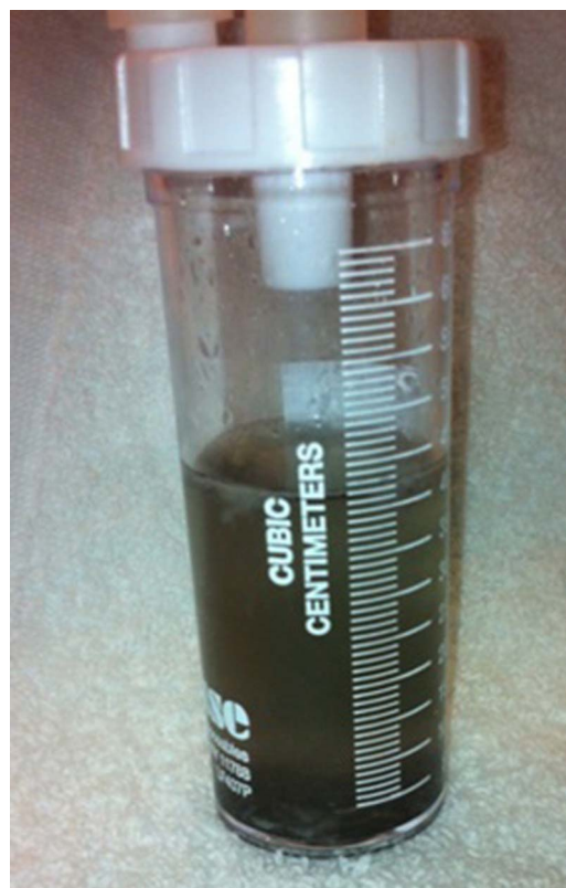
Figure 3 Bronchoalveolar lavage obtained from the lingula shows dark soot-coloured fluid.