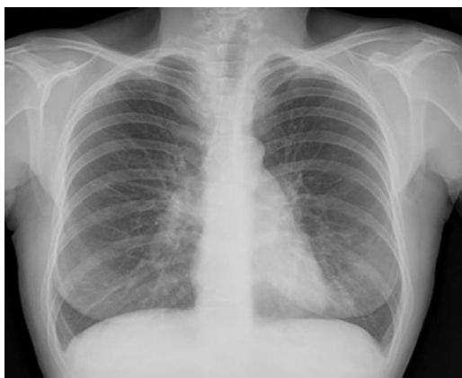
Figure 1 Chest X-ray showing airspace disease in the lower zones bilaterally.

RB-ILD is a type of idiopathic interstitial pneumonia that is classified as a smoking-related lung disease having the pathological features of respiratory bronchiolitis, clinical symptoms of cough and dyspnoea; high-resolution CT usually shows diffuse