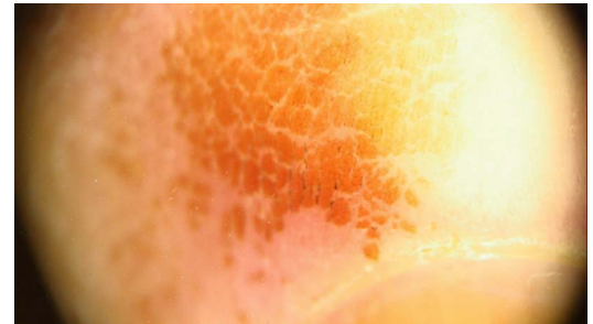
Figure 2 Dermoscopically, light brown reticulate patches formed of superficial fine, wispy strands that do not follow the furrows and ridges (original magnification \times 10 ).

Tinea nigra is a rare superficial mycosis, seen particularly in tropical regions, and caused by Hortaea werneckii . Hyperhydrosis and living in coastal regions or hypersaline environments are predisposing factors. 1 The condition is characterised by pigmented, macular patches localised on the palms or soles, which potentially mimic pigmentary lesions such as melanoma, especially when presenting as a solitary lesion. 2 Once suspected, it can easily be diagnosed with a simple KOH and dermoscopic