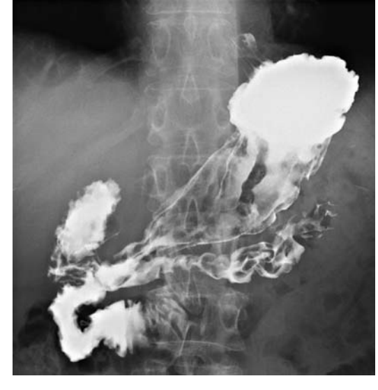
Figure 3 Barium swallow showing reflux disease and two stomachs connecting at the pylorus.

A CT of the chest and the abdomen demonstrated moderate centrilobular emphysema with patchy peripheral consolidation in the right upper lobe, middle lobe and lingula, which was likely to be inflammatory in nature. Incidentally, it was found on CT scan that she had a duplication of her oesophagus and stomach (figures 1 and 2), with a