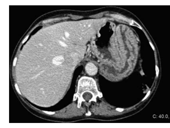
Figure 2 CT scan showing duplication of stomach.

small hiatus hernia affecting one of the stomachs. Both stomachs had normal appearances and were connected at the pylorus. The level at which the duplication occurred in the oesophagus was not clearly demonstrated on CT scan. A barium swallow was arranged to demonstrate reflux and confirm duplication of the mid, distal oesophagus and stomach, connected at the level of the pylorus (figure 3). A trial of proton pump inhibitors improved her symptoms. Certainly, the dual oesophagus and stomachs could contribute to possible recurrent aspiration pneumoniae and chronic cough. She continues to be followed up in the respiratory clinic.