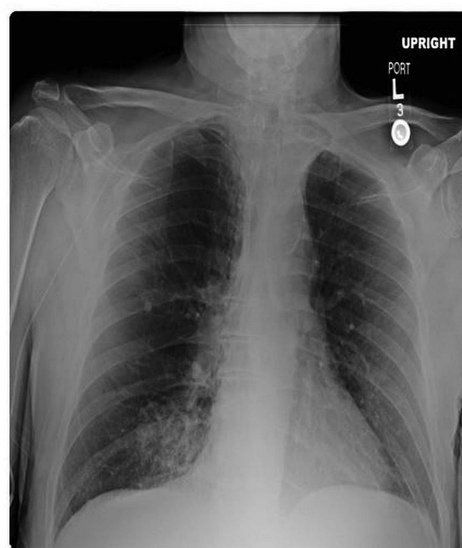
Figure 1 Chest X-ray demonstrating new right lower lobe infiltrates.