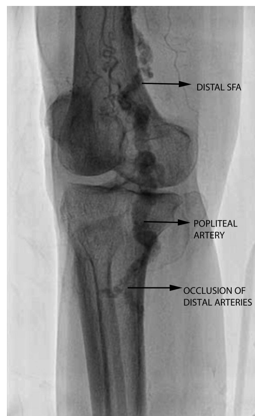
Figure 1 Anteroposterior view showing extensive calcification of the distal right superficial femoral (SFA) and popliteal artery and total occlusion of proximal anterior and posterior tibial artery.

iliac, common femoral and proximal significant occlusion of the superficial femoral artery with extensive collaterals; flow in popliteal artery was noted with diffuse distal disease in right lower limb