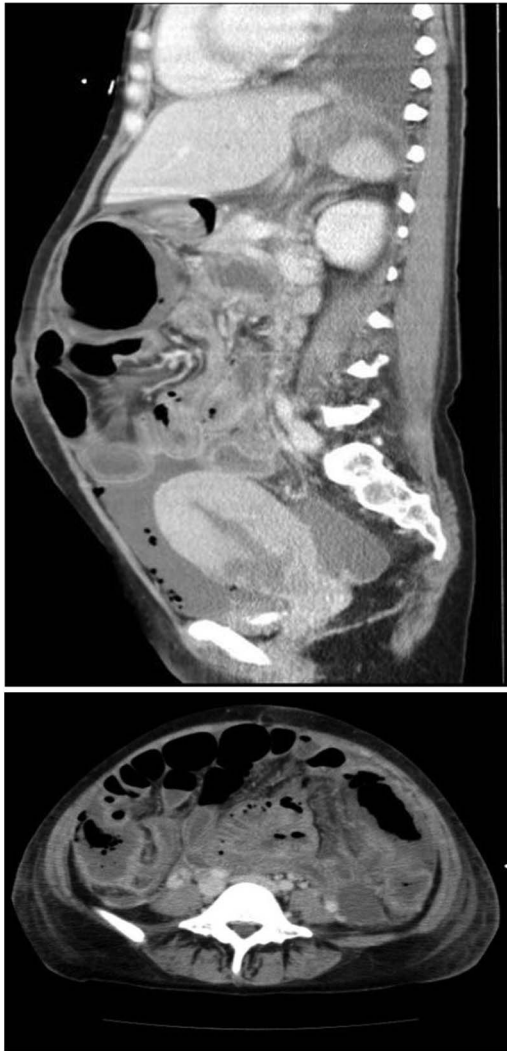
Figure 1 Abdominal CT, initial.