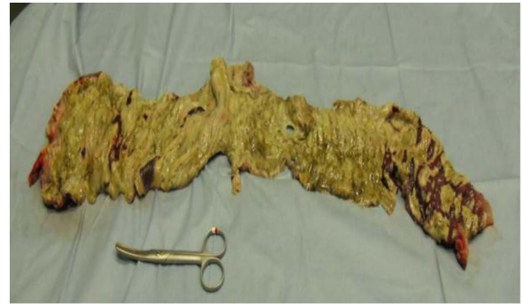
Figure 2 Surgical specimen.

The patient was managed with a temporary closure of the abdomen by vacuum pack from the first to the fourth day after surgery. The abdominal cavity was irrigated every day, but necrosis progressed. Parts of the intestinal tract were removed surgically every day due to perforation, resulting in a descending colon stump and a jejunoleal stump. An artificial anus was constructed at the ileum end on the fourth day. More than 5000 mL of watery diarrhoea was collected per day after the construction of the artificial anus.